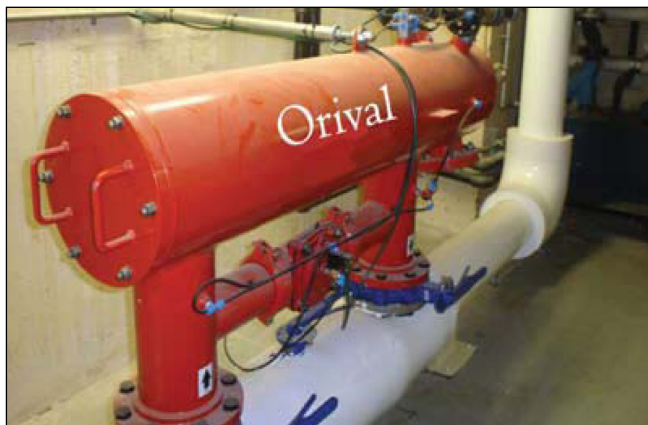
Figure 2: Filter Installation

If any problem should occur with the filter, the controller will sense this and open the built-in bypass valve to provide a continuous flow of water to the new chiller. Full stream protection, automatic self-cleaning process, automated bypass system and low maintenance were just the qualities the engineers were looking for in a protection system for the new magnetic chiller.